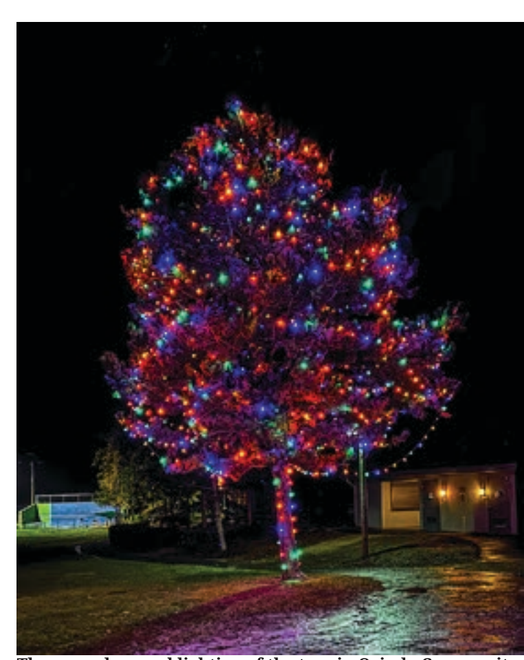
The second annual lighting of the tree in Orinda Community Park on Dec. 2.

and gifts. Most of the vendors décor, rugs, woodwork, clothing and accessories to photography and house plants. The